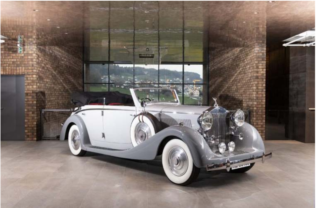
1937 Phantom III four-door cabriolet by Voll & Ruhrbeck of Charlottenberg, Berlin. For years it resided in a private collection of some 25 Rolls-Royce, in Lichtenstein, until the whole collection was auctioned in 2021.