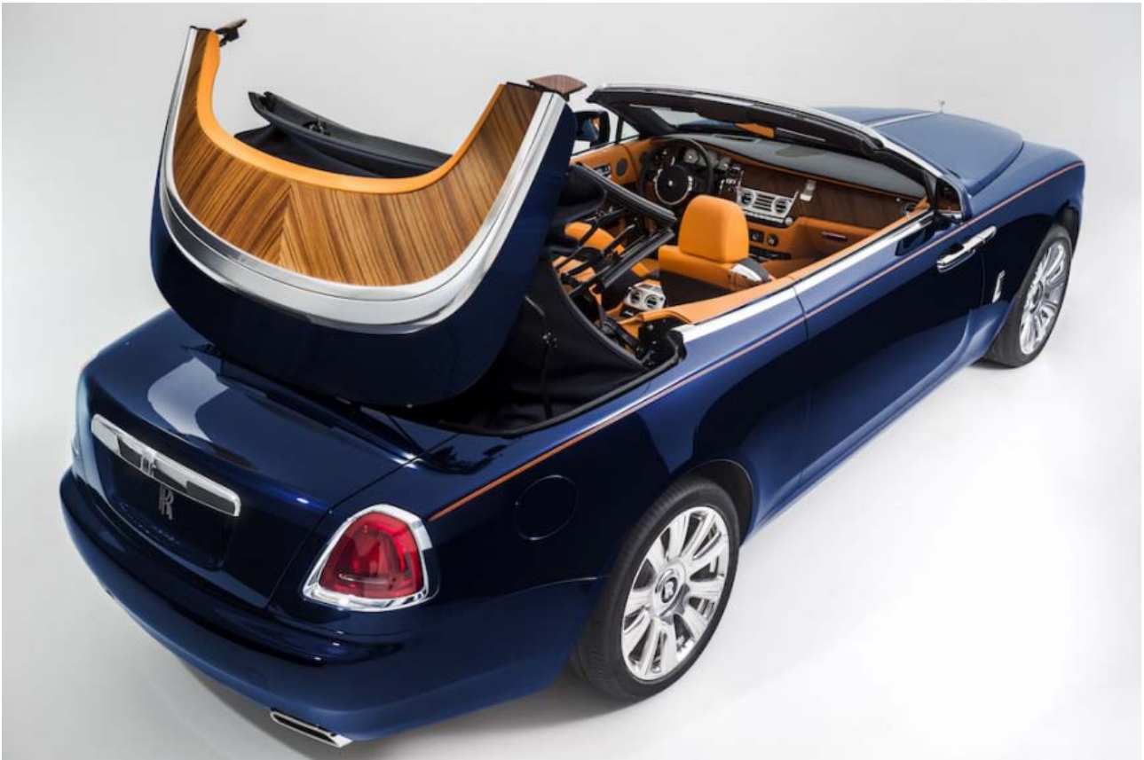
The complex top mechanism of the Rolls-Royce Dawn convertible.