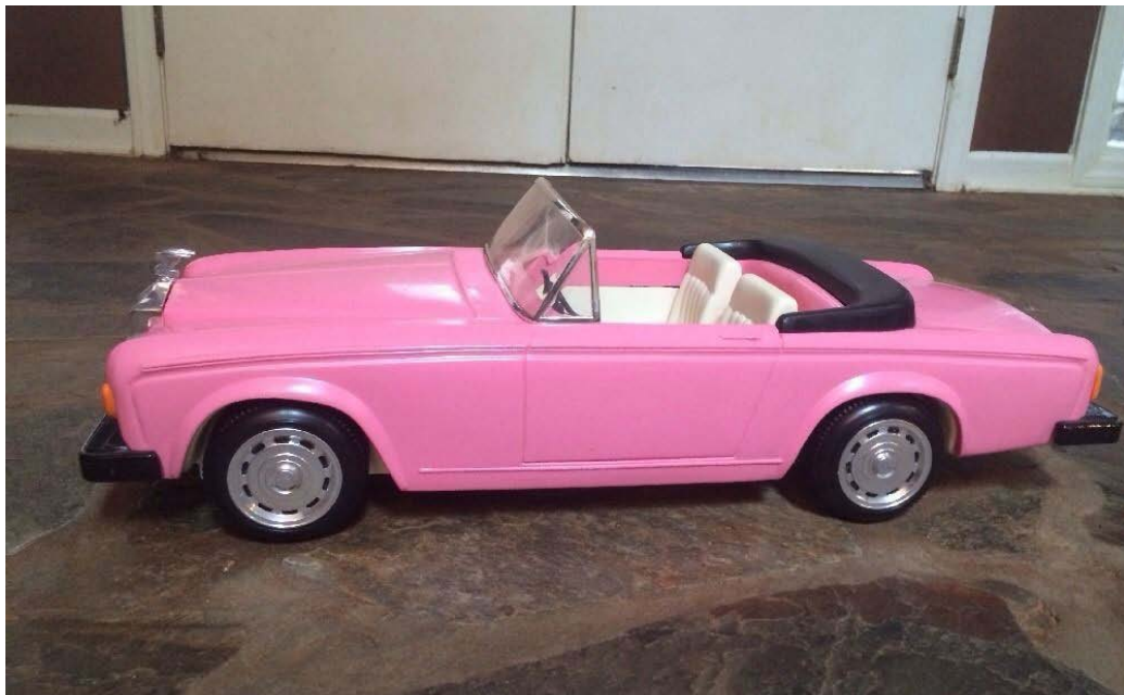
And for Barbie Doll her thin plastic self, there is the official Barbie Doll Silver Shadow Convertible. (The top mechanism is much simpler: There is no top mechanism, nor top!)