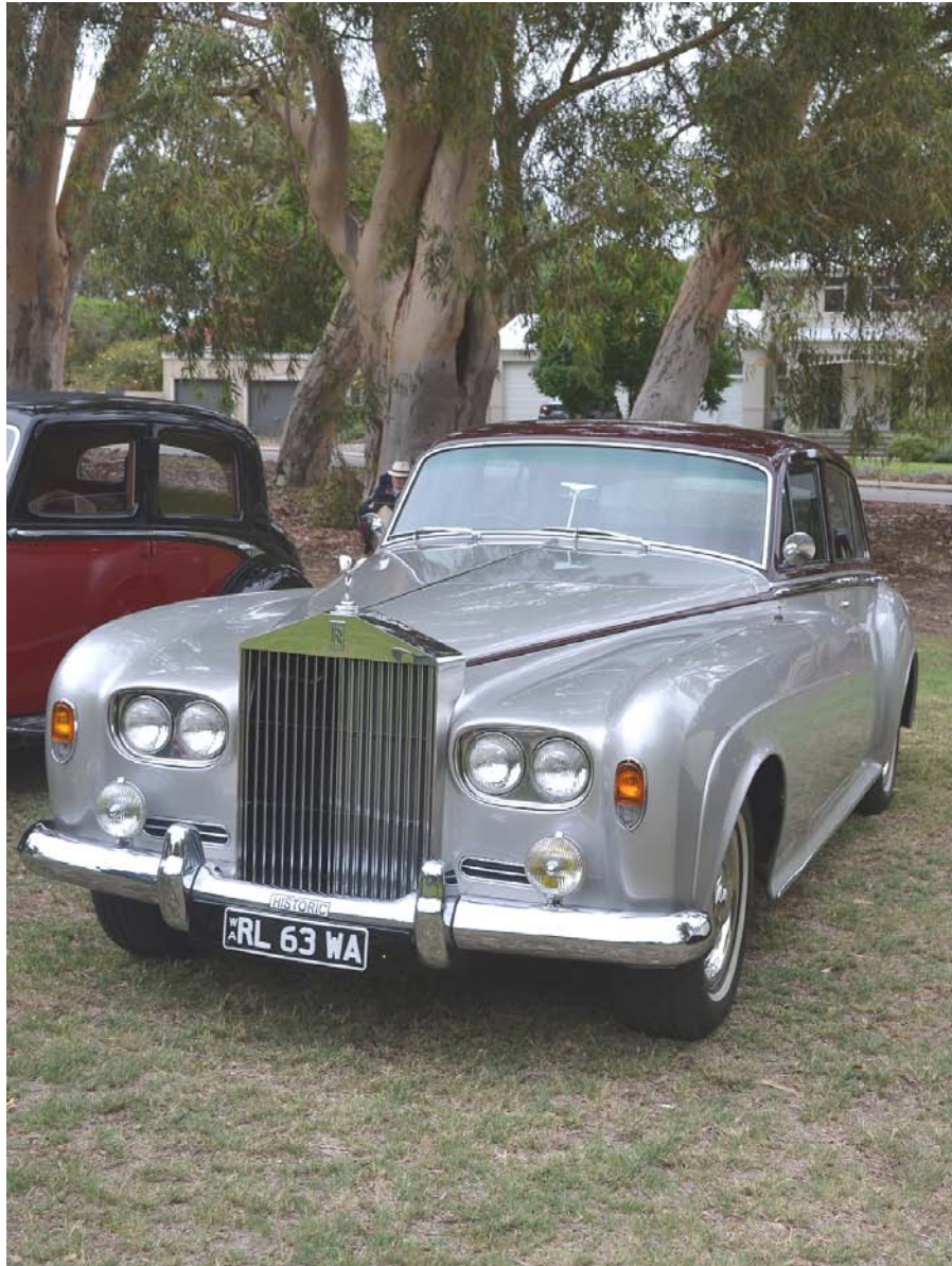
Outright winner, 2022 concours: Roy Lyons' superb Silver Cloud III

The views expressed in this publication are not necessarily those of the Rolls-Royce Owners' Club of Australia