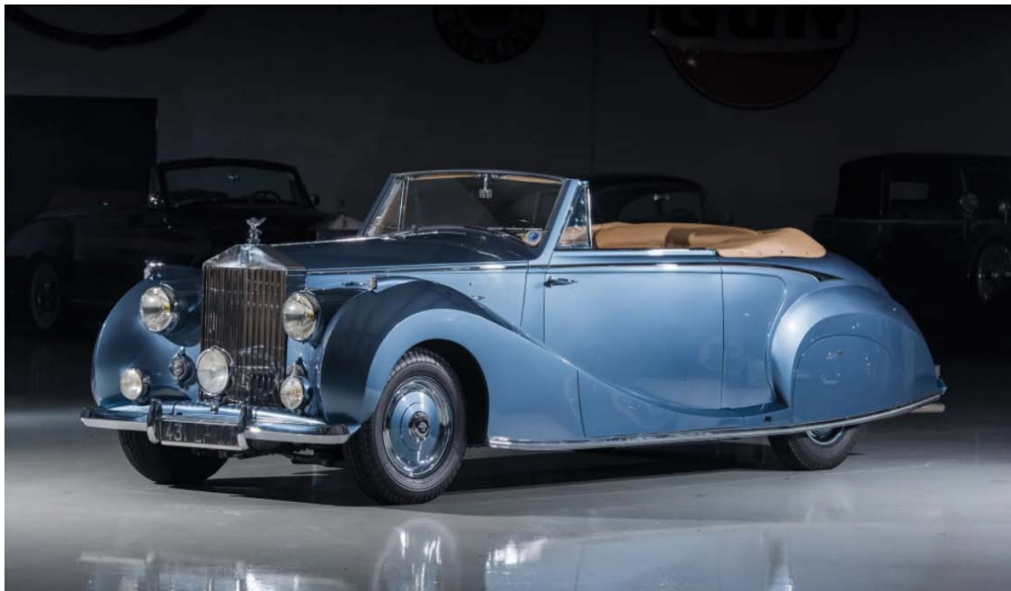
1948 Silver Wraith Cabriolet, by Franay, adding a new meaning to "razor edge" styling.

Franay was founded in 1903, and ceased coachbuilding in 1955. This French coachbuilder was located in west Paris, in the suburb of Levallois-Perrot, which is on the Seine.