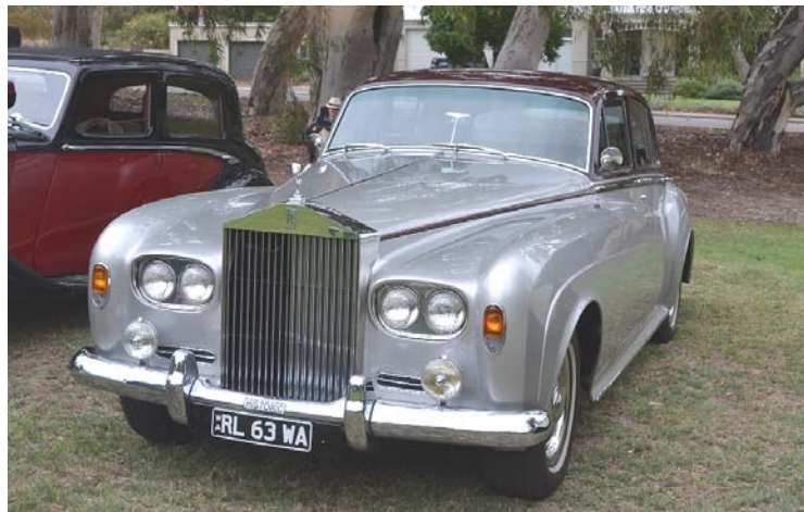
Outright Winner: Roy Lyons superb Cloud III; also Ladies Choice.

THIS YEAR'S Concours took place on Sunday 27 March at Stirling Square, a park located in the historic suburb of Guildford nestled in Perth's foothills, along the upper reaches of the Swan River.