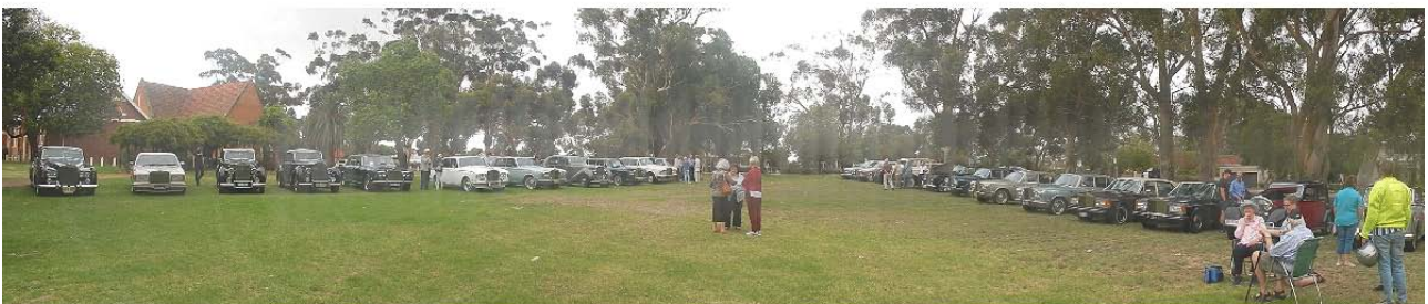
Alan Dickson took these lovely panoramas, showing the impressive lineup of proper motor cars on the day