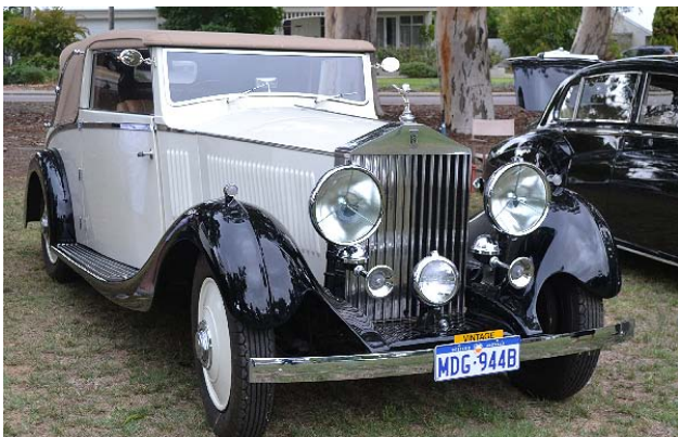
Class 3 Winner: Charles Bush, 20/25 Also Best Resoration

As this whole process took a good two hours under an open sky, it was fortunate the forecast rain did not materialise. We were actually blessed with clement weather, a balmy 26 degrees with cloud cover.