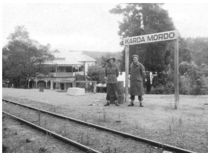
Mundaring Weir pub in background, 1940s.

Back at the beginning, the line went all the way from the top of the weir, to the bottom, via a series of "zig-zags". These still survive, as walking pathways.