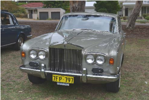
Stan Stroud's Silver Shadow won its class - again!