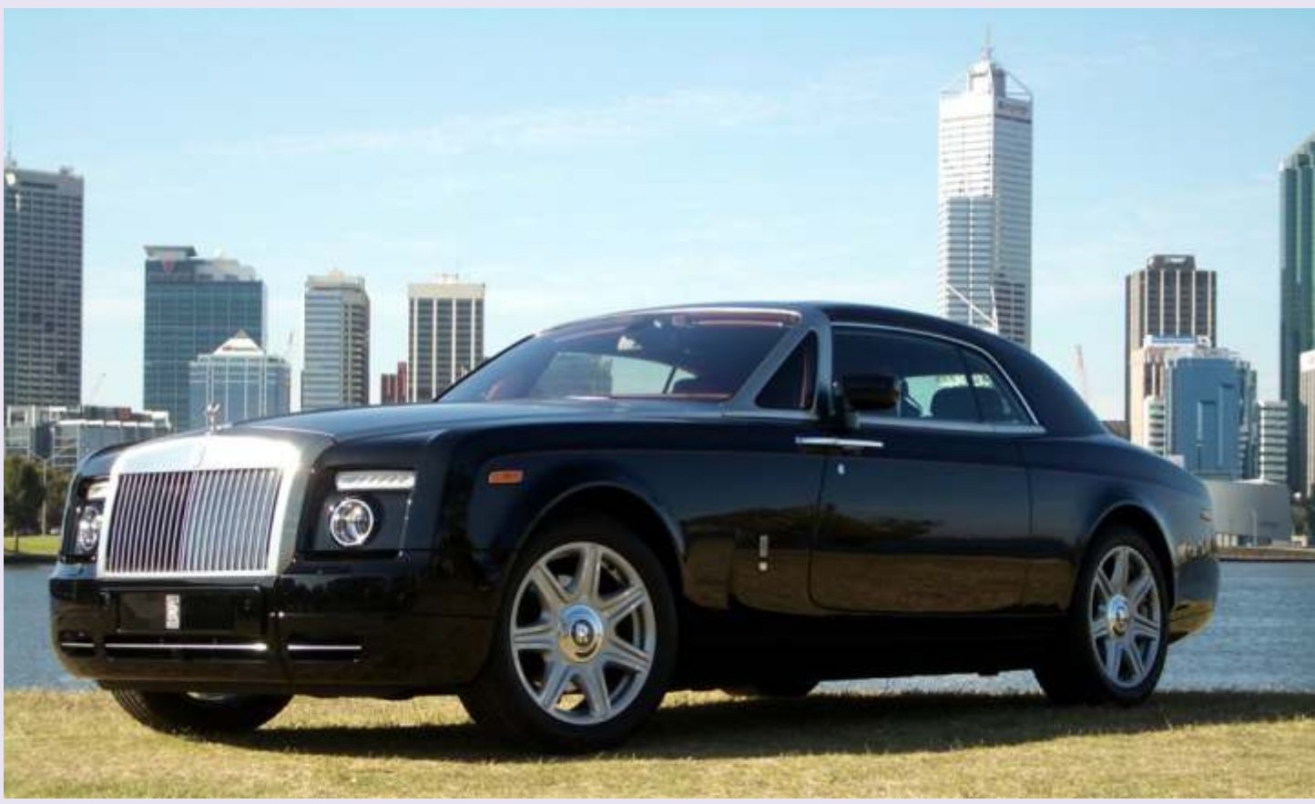
In fact, that's me behind the wheel of the car on St Georges Terrace. And the photo below is one I took on the South Perth foreshore. That evening I attended a gala event at the Convention Centre to show the car off to potential buyers before the Phantom Coupe headed east. - Paul Blank