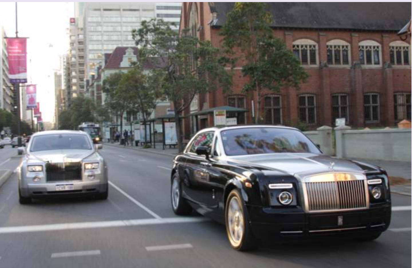
Back in 2008, when the very first Phantom Coupe landed in Australia, Perth was its first stop on a nation-wide media tour. Back in those days I did quite a bit of motoring writing for different magazines, and fortunately I was the first motoring journalist to drive the new car in Australia.