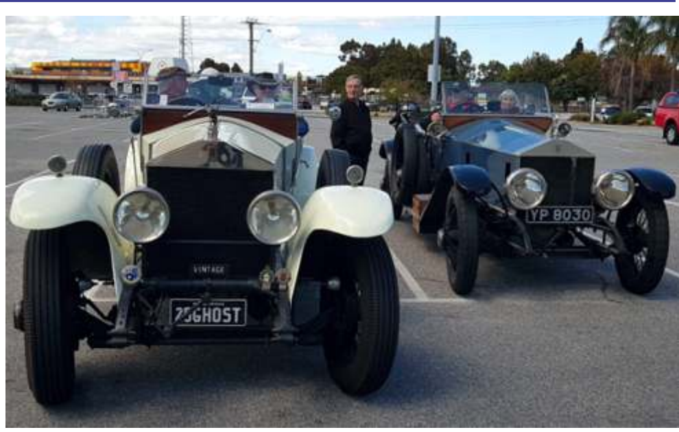
Above: The pair of Silver Ghosts proved quite a sight for club members and the public.

The Motor Museum has been taken over by new owners (08 9641 1288) with many of the old exhibits being retained, however, additional cars and motorbikes have been added. One of the exhibits was a 1906 American-built Holsman "High Wheeler", which has large- diameter horse and cart wooden wheels and extremely primitively designed petrol engine, steering mechanism and front axle. It just looked like a motorised horse buggy with very questionable mechanical reliability and a total lack of passenger comfort. - Many US makers were very slow to modernise their designs, making antique designs compared to the Europeans. - Ed